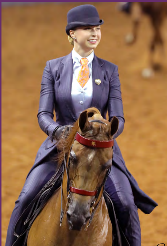
Photography by Ferrara