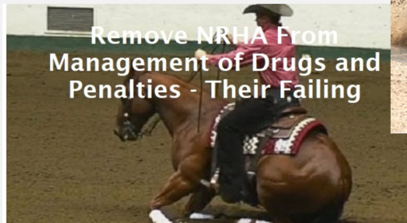
Remove NRHA From Management of Drugs and Penalties

Many concerned competitors and industry professionals from across the U.S. and around the world have questioned the addition of romifidine as an approved medication and have been urging NRHA to reconsider its addition and use.